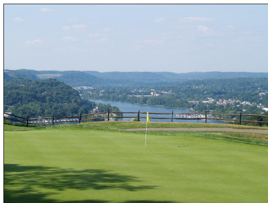
A view of the Allegheny River with the 15th green from the Longue Vue Club in the foreground.